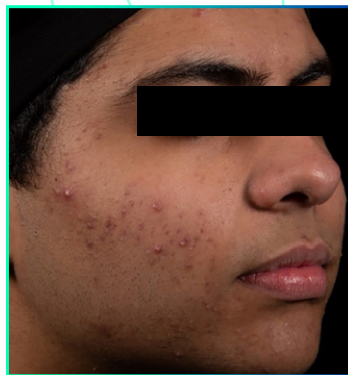
BASELINE MEDIAN IGA SCORE: 3 (Moderate)