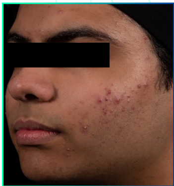
BASELINE MEDIAN IGA SCORE: 3 (Moderate)