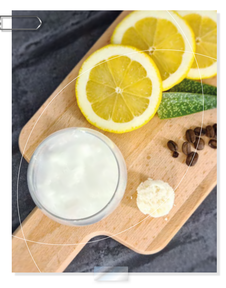
Activate your base with water!