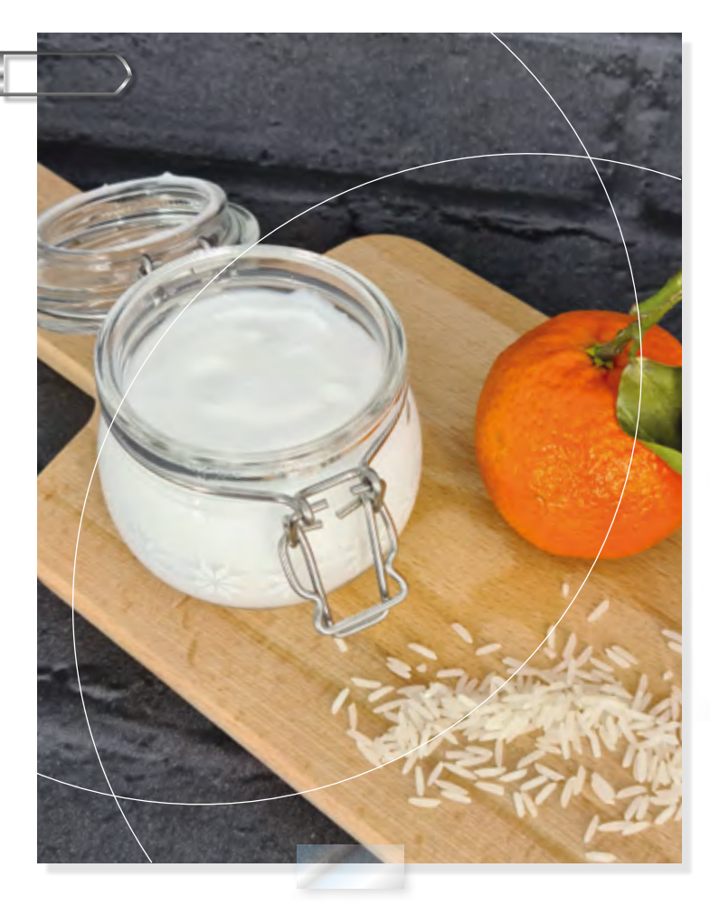
Customizing your cream is so easy!