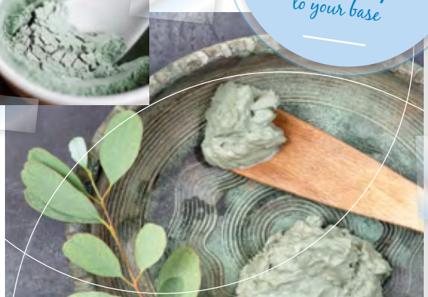
Properties & benefits for your Body

Add 5% or 0.75gr of green clay to your base